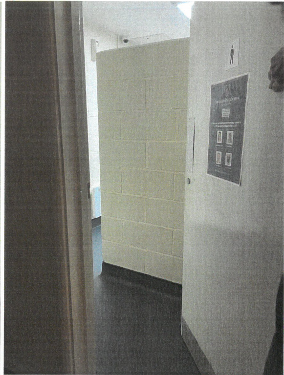
Pendall Building example (C Block)