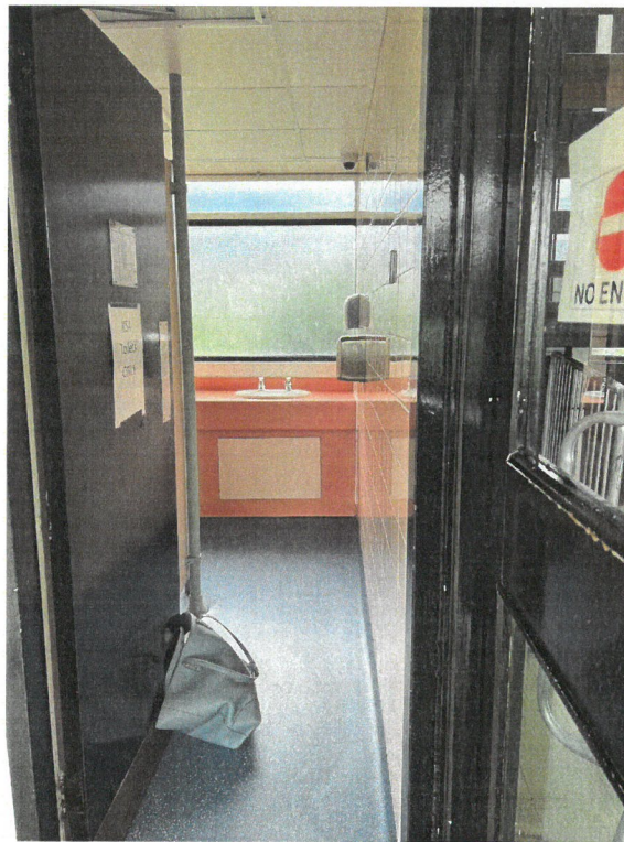
Smithson Building example (A Block)