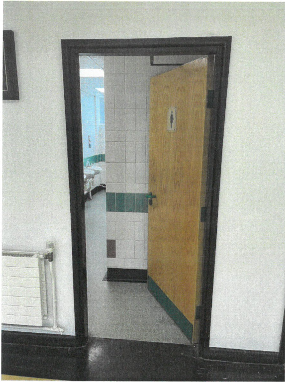
Shaw Building example (D block)