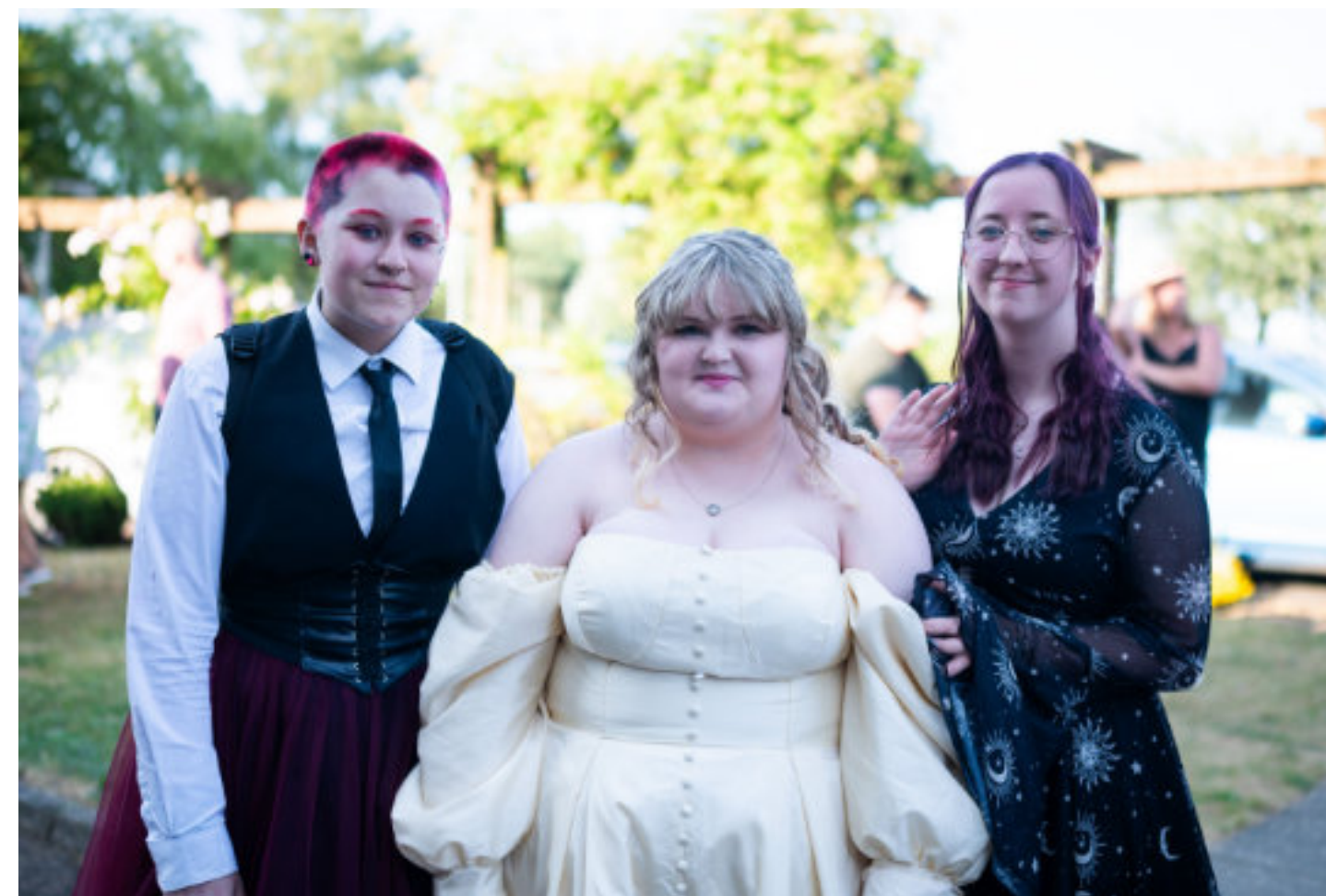
It was great to celebrate our students' end of schooling at Smithdon High School! All the staff at Smithdon wish them a lifetime of success and happiness.